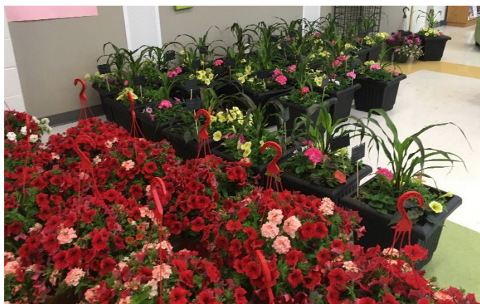
Spring Plant Fundraiser:

We will let you know a specific date but will be during the week prior to Easter.