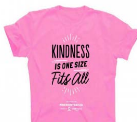
Show your support for Pink Shirt Day

Winter Walk Day is also scheduled for Feb. 5, however, most of our students are away that day so we will have to reschedule this event. Gr. 3-6 students are at the Winspear Centre & the Jr. High students are going to Misty Ridge Ski Hill.